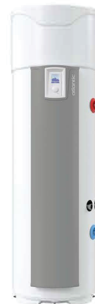
EXPLORER HEAT PUMP 200-270L

For further information, please contact us.: