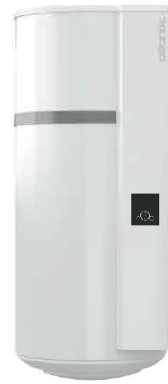
CALYPSO VM 100-150L