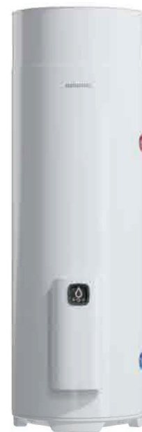
EGEO HEAT PUMP 200-250L