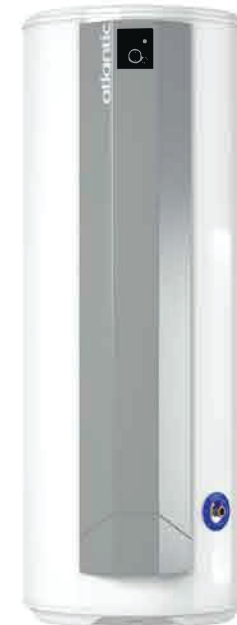
CALYPSO SPLIT INVERTER 200-270L